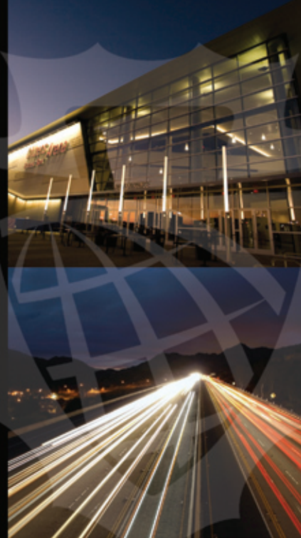
CONAN NOLAN, EMCEE NBC NEWS